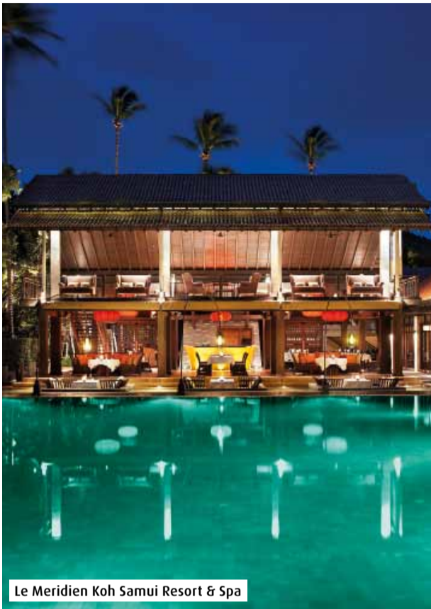
Le Meridien Koh Samui Resort & Spa