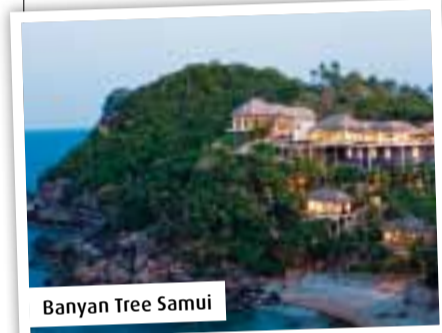
Banyan Tree Samui

99/9 Moo 4, Maret, 66 (0)77-915-333. www.banyantree.com/en/samui