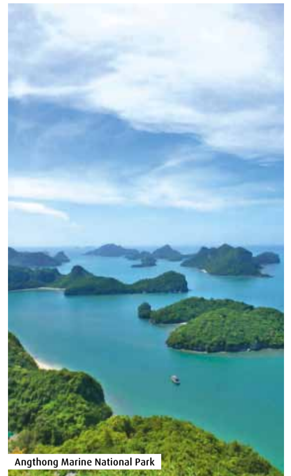
Angthong Marine National Park

With the dishonorable exception of the main town of Chaweng (it really is pretty grim), Samui isn’t a place to party. The scene is still to outgrow the bucket and beer brigade, and there are precious few venues worth venturing out for. In fact, if you’re after a change of scene, then spending an evening at another hotel or resort is probably your best bet. The bar at Hansar runs a happy hour several times a day, and W attracts a hipper crowd than most (even though it’s a bit of a trek).