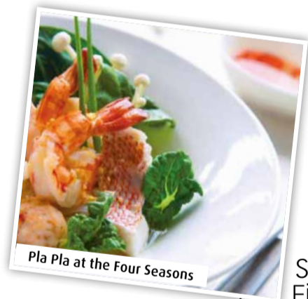
Pla Pla at the Four Seasons

Beach club Sunday brunches, complete with daybeds, DJs, and drinks, are a fairly new thing in Samui. At Beach Republic (176/34 Moo 4, Maret, 66 (0)77-458-100. www.beachrepublic.com ) on peaceful Lamai Beach, you can lounge on huge outdoor beds or in the oceanfront infinity pool between international