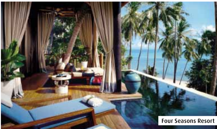
Four Seasons Resort