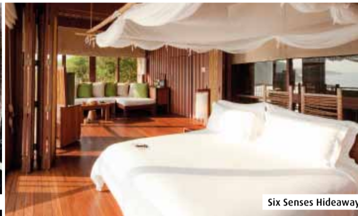
Six Senses Hideaway