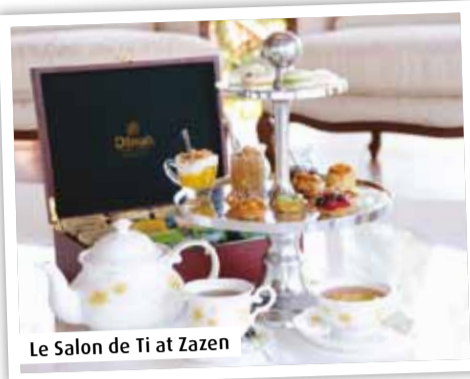
Le Salon de Ti at Zazen